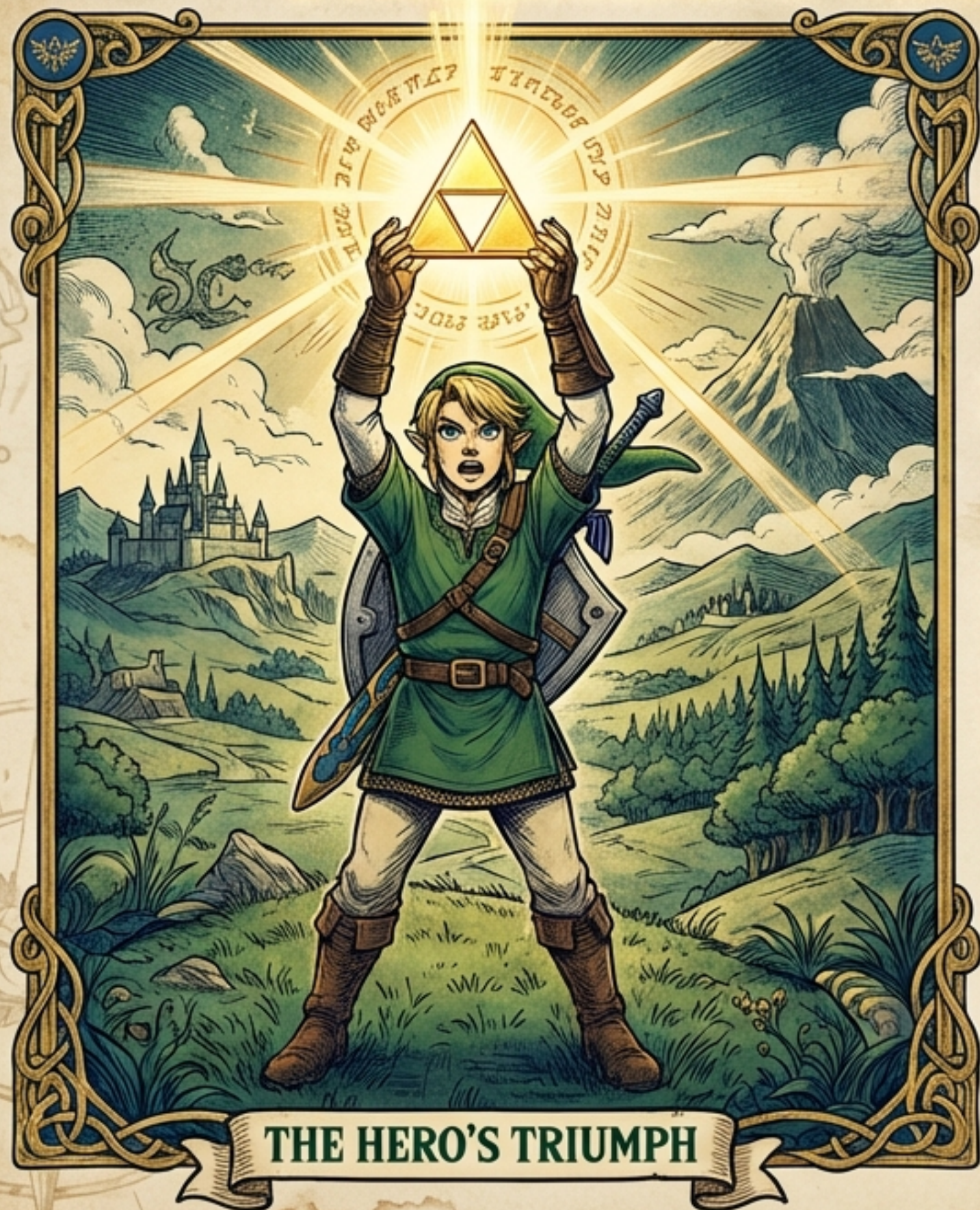
THE HERO'S TRIUMPH