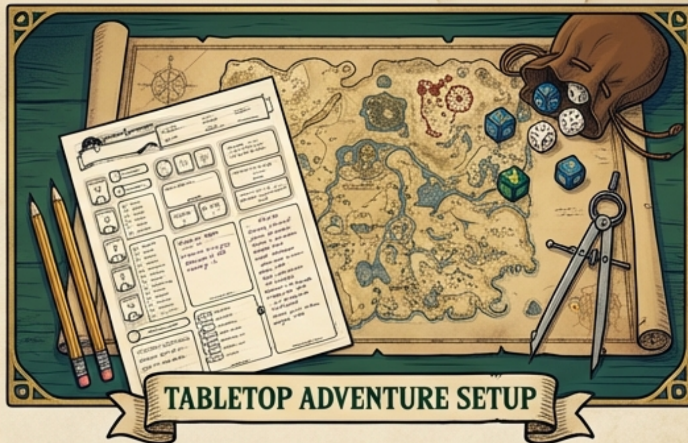
TABLETOP ADVENTURE SETUP